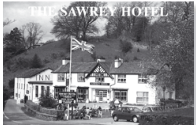
The Sawrey Hotel, Lake District

We hope you can participate again this year, a form is enclosed for your reply. I hope you will get some fun out of it and that we can raise a useful sum to continue the work of the trust.