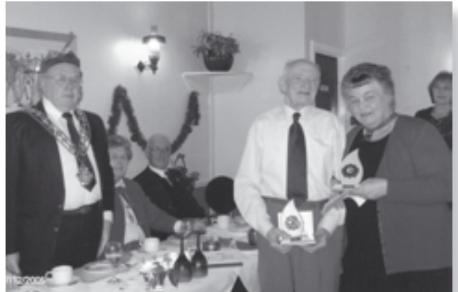
Mayor of Calderdale presenting Race Trophies